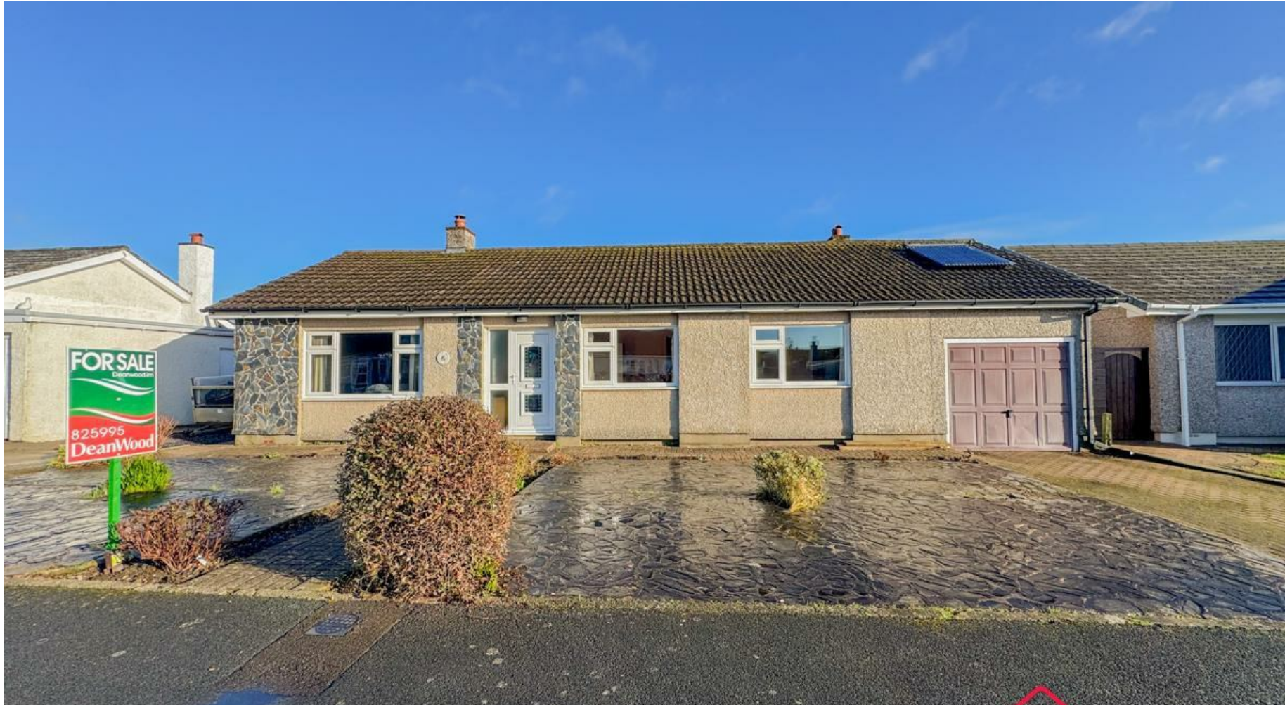
27 Silverburn Drive, Ballasalla, Isle of Man, IM9 2EF Asking Price £415,000